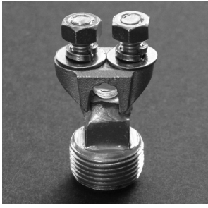
Span Wire Clamp