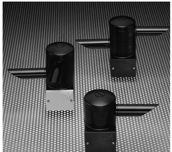
— Models 722, 721 (back) and 711

Models 711, 721 and 722 offer significant advances and flexibility for specific intersection applications. The detectors are designed for common applications in three configurations: one detector - the single channel 711; two detector - the single channel 721; and two direction, two output detection - the dual channel 722. All Opticom 700 series detectors greatly reduce installation and life cycle costs through their modular design, adjustable tubes and compatibility with existing Opticom intersection and vehicle equipment.