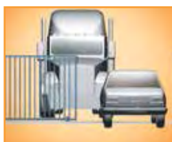
adjustable partial open for different opening distances