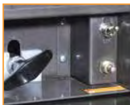
built in power switch and reset switch