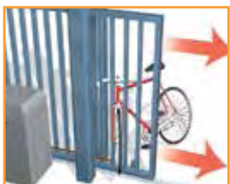
entrapment detection reverses gate when obstructed