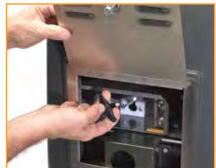
easy to use "T-Handle" release